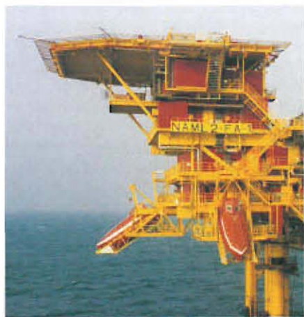
The new NAM L2 gas production platform (insert) is also equipped with an aluminium free-fall lifeboat from Verhoef.

'There was yet another surprise waiting for my father during our anniversary,' says Martin Verhoef. 'We were lucky enough to track down the first free-fall boat we ever built during the early sixties, and bring it back to The Netherlands. We found this boat, which was in fact still in very good condition, in the Central American Republic of Belize. We then secretly completely spruced up the boat and unveiled it in its full glory during our anniversary celebrations. For our founder in particular, it was a very emotional occasion. It was striking that, after so many years roaming the whole world, the boat still looked so good. That really says something about the use of aluminium for manufacturing high quality lifesaving appliances,' concluded Verhoef, whose company's work has again made it that much safer at sea. ■